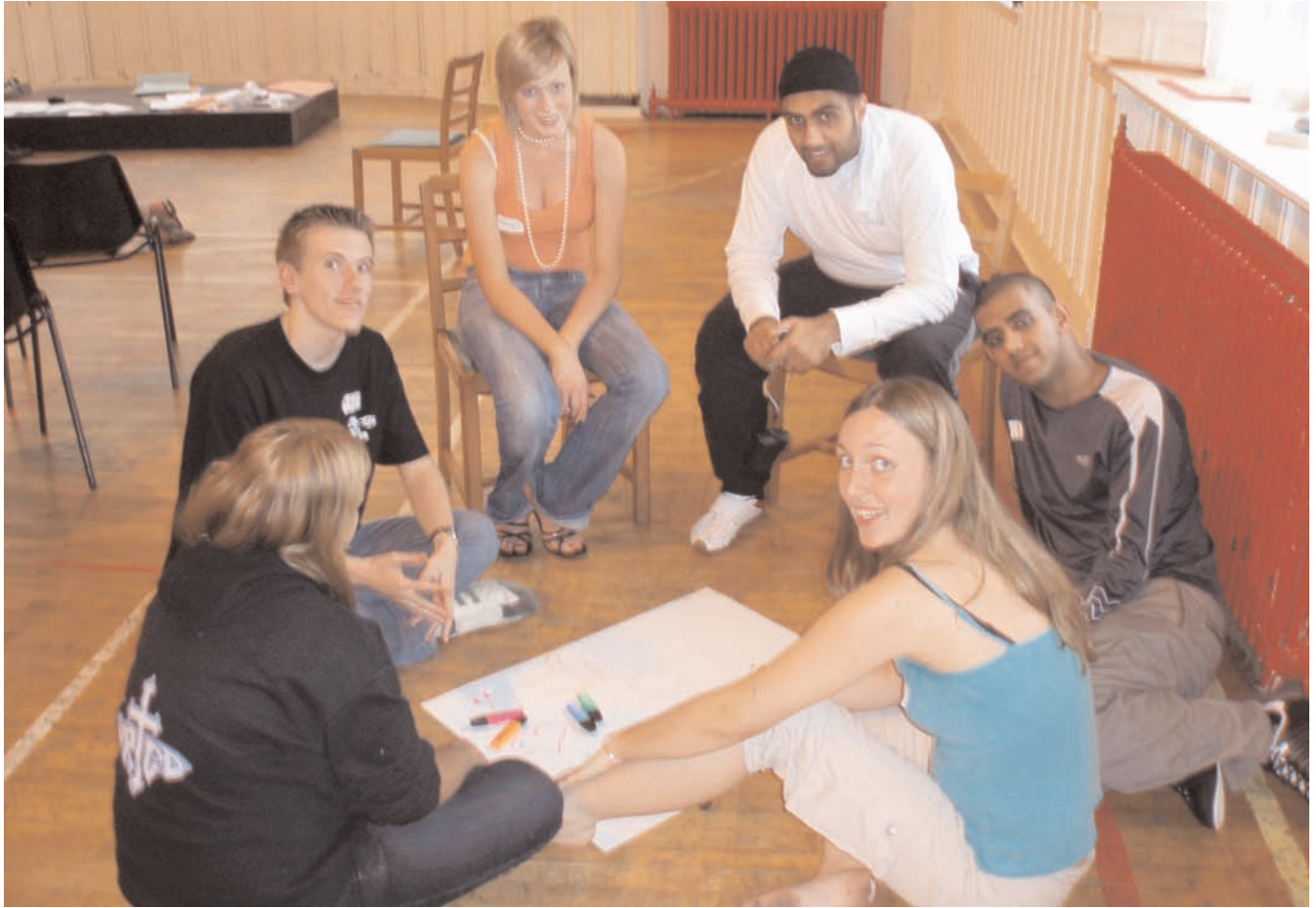
Young volunteer researchers taking part in the training at the residential.