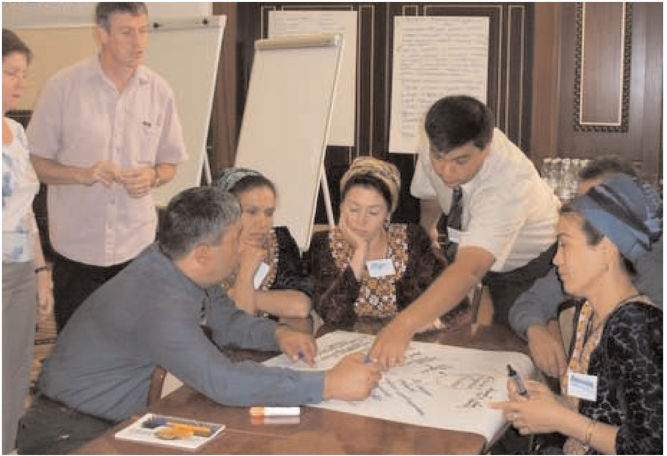
Participants discuss family assessment

The participants of the workshops evaluated them highly and said they would use what they had learnt in their work with children and families and also planned to share some of the materials, exercises and discussions with colleagues to protect and promote the interests of children in their communities.