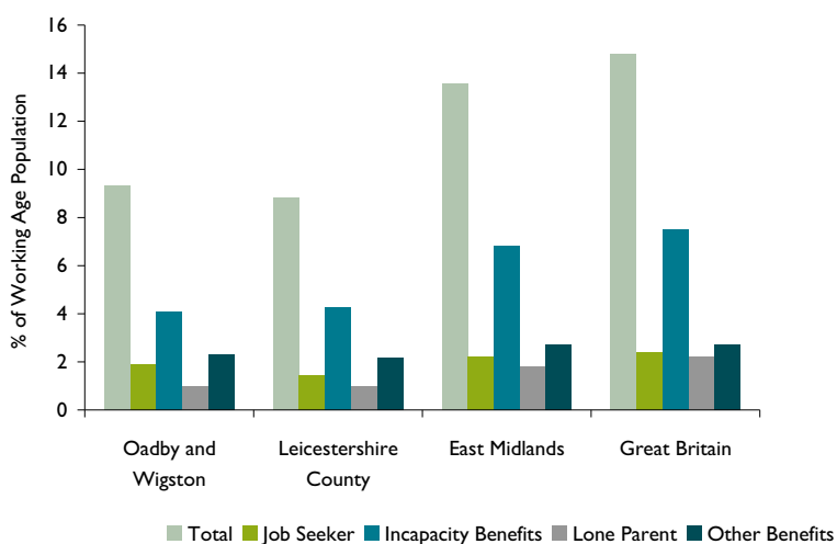
Figure 5: Benefit Claimants