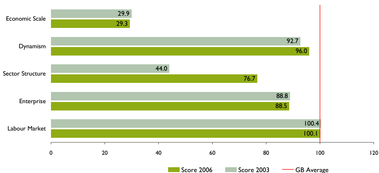
Figure I: Competitiveness Summary Chart for Oadby & Wigston, 2003 & 2006

Note: For full details of the 2003 scores see http://www.lsint.info/downloads/Baseline_Survey2.pdf