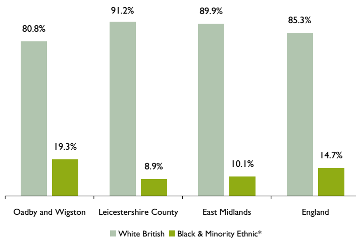
Figure 3: Ethnicity Population Estimates

Note: * Includes White Irish and White Other. Figures may not add due to rounding.