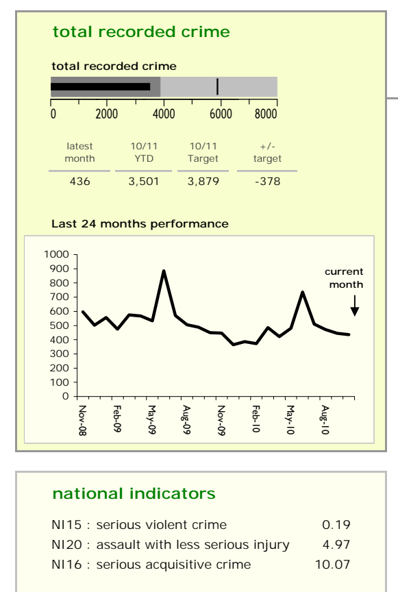
(Rate per 1,000 population)